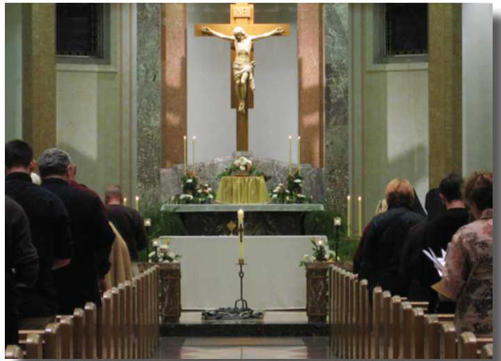
Friars and Third Order Secular Franciscans joined us for our 2010 Transitus celebration of Our Holy Father Francis's passing into Eternal Life. A friar's habit (pictured here before the altar) was carried in procession by the Conventual Friar novices to represent this glorious event.