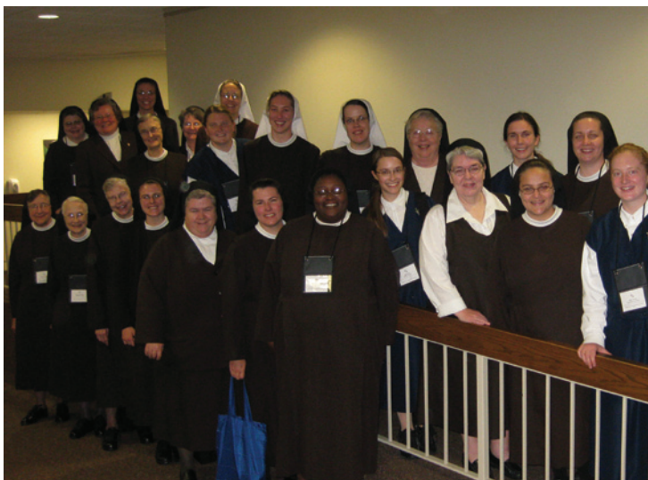
Sisters gather for a group photo at the Council of Major Superiors of Women Religious National Assembly in Belleville, IL.