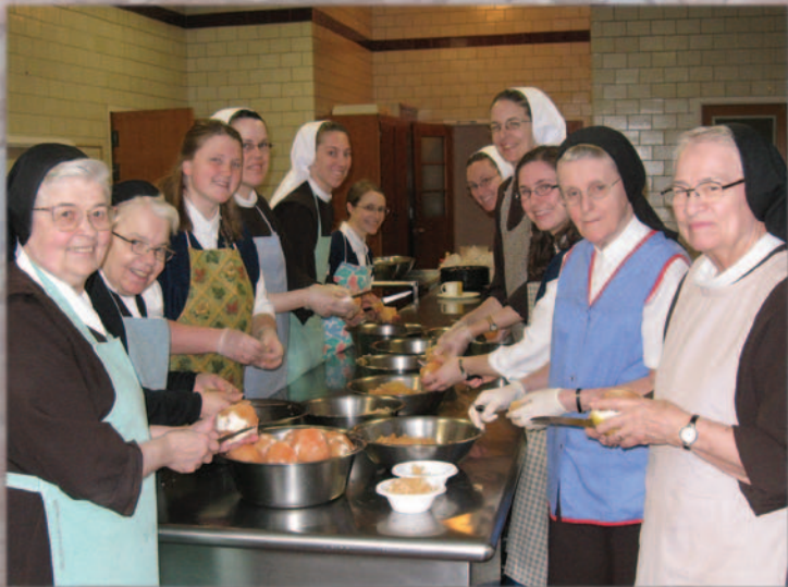
The Sisters having what we like to call a "grapefruit party" - sectioning grapefruit for our Easter Sunday breakfast.