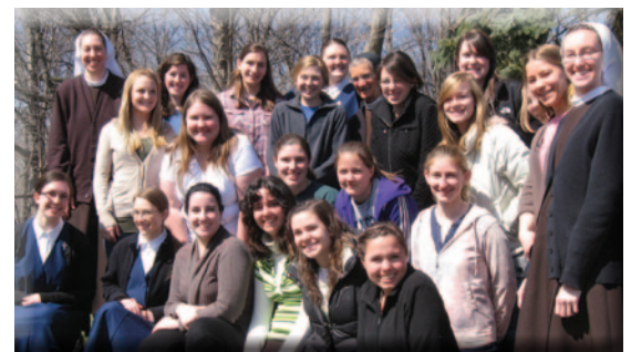
The young retreatants gather for a photo with the novices and postulants.

In coming away for a time from the busyness of their lives they can more easily hear God's voice and gain strength to follow His call.