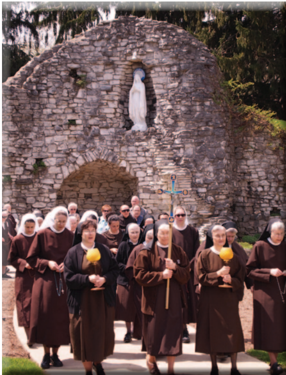
The Sisters and members of the Secular Franciscans process from the grotto for this year's May Crowning.