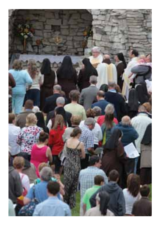
The faithful adore the Blessed Sacrament at the Lourdes grotto.