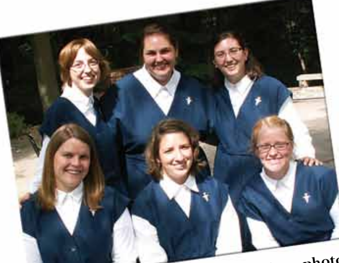
The postulant class of 2013 poses for a photo just one day after their entrance.