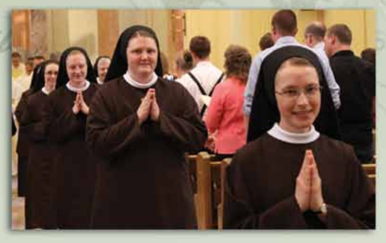
The four newly professed Sisters process out of the chapel full of hope and joy.