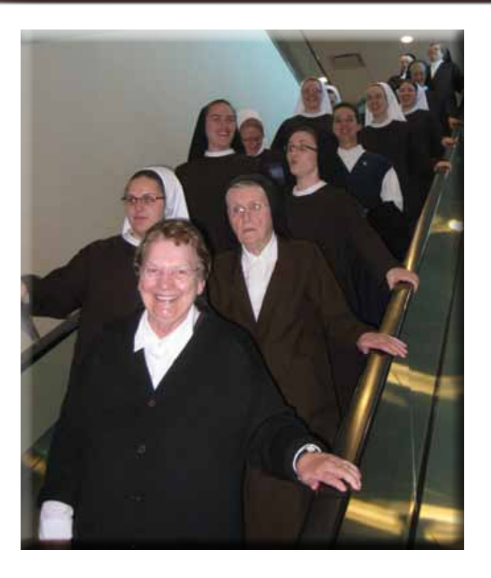
Sisters are all smiles as they depart the 100 year celebration of Franciscan St. Francis Health in Indianapolis.