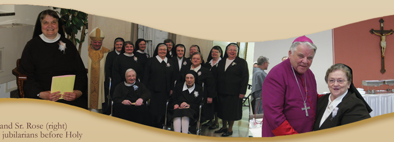
Jubilarians gather for a group picture with Bishop D'Arcy.