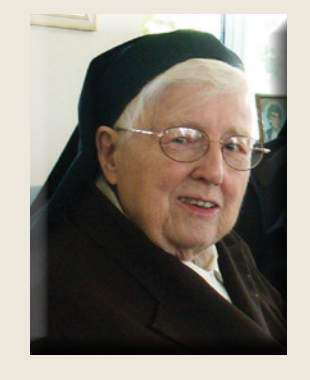
"I can't imagine what people miss the graces God wants to give to us if we come for Adoration. He gives us everything. He gives us Himself."