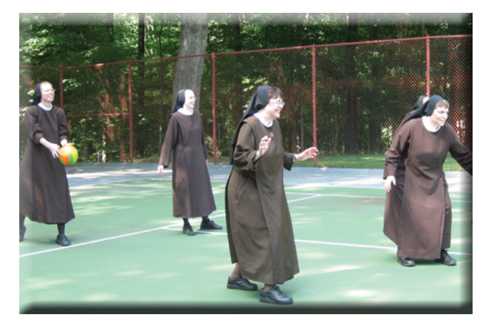
After a great day of prayer, work, and study, the Temporary Professed Sisters stop for a bit of fun on the volleyball court.