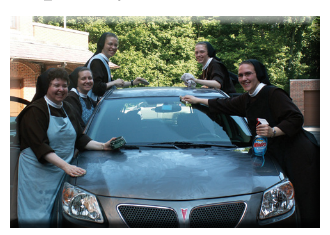
Temporary Professed Sisters washed and waxed the house cars for one of their summer projects. Look at that shine!