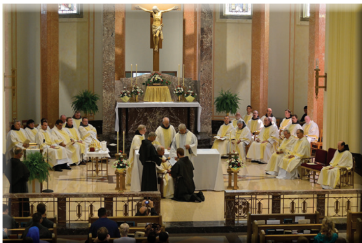
The Sisters were blessed to host the Conventual Franciscan Friars for the simple vow ceremonies of their novices at the convent chapel in July.