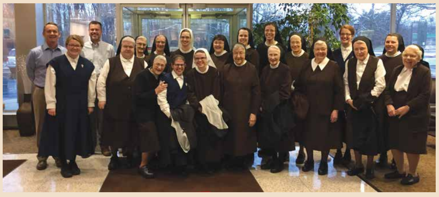
The Sisters appreciated the warm welcome received at Our Sunday Visitor in Huntington, Indiana.