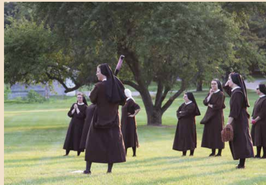
Clockwise from top: Players and spectators enjoy a game of softball. Night Prayer ends with a procession to St. Joseph, Blessed Maria Theresia, and Our Lady. Sisters gather for fun and fellowship in the guest cafeteria. We honor Our Blessed Mother with a rosary procession to the grotto.